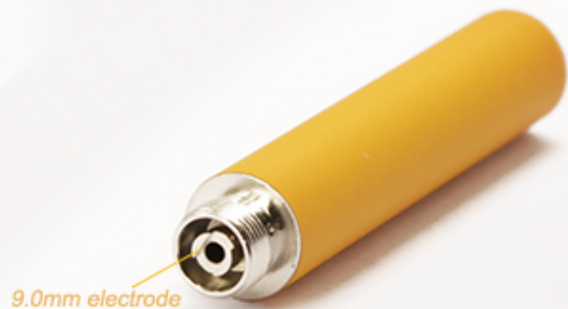
New Type Cartomizer

(Works only on the old type 3.7/3.3mm screw of eGo or 510 battery)